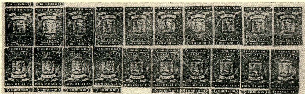
Fig. 1. 1860—2 Reales, red, coarse impression, 3rd setting. Complete reconstruction of all tete-beches by means of block of 4, a pair, and a block of 14.

Lt.-Gen. Wickersham filled the remainder of the wall frames with a portion of his collection of early Venezuela stamps. His display was devoted to the stamps issued from 1859 through 1870. The collection is a remarkably complete one and is distinguished by the large number of complete sheets and settings of these finely lithographed stamps. We are able to illustrate some of the outstanding items shown in the frames by the